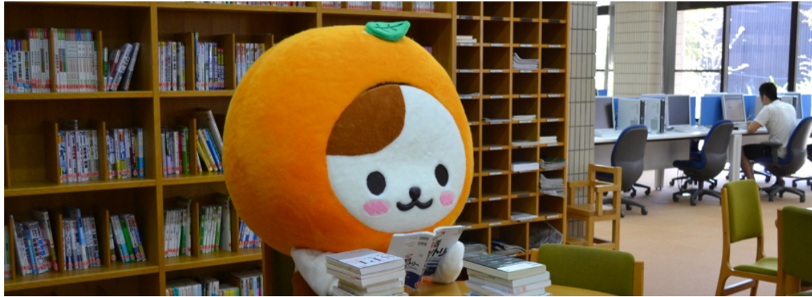
Wadanyan, Wakayama University's mascot awaits your arrival.

Congratulations if you survived this process! You can now visit Wakayama, Japan.